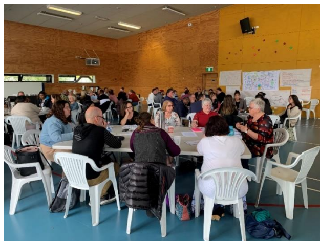
Group work at the conference