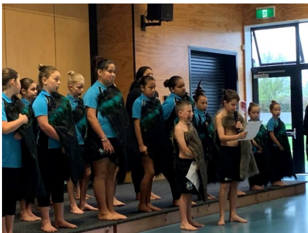
The Kapahaka group from Endeavour School, Hamilton providing the Whakatau (welcoming ceremony) to our Support Workers Conference