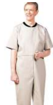
Especially designed clothing