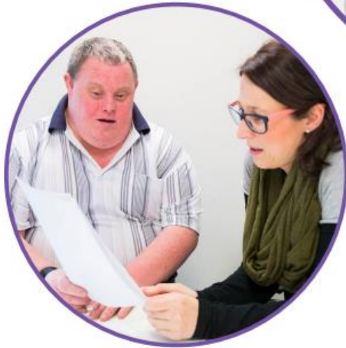
People who support me