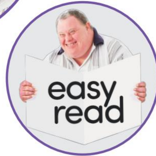
Things that support me